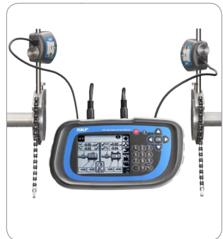
Easy result storage values